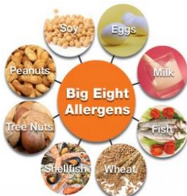
Figure 1: The "Big Eight" Allergens: Tree Nuts, Peanuts, Soy, Egg, Milk, Fish, Wheat and Shellfish.